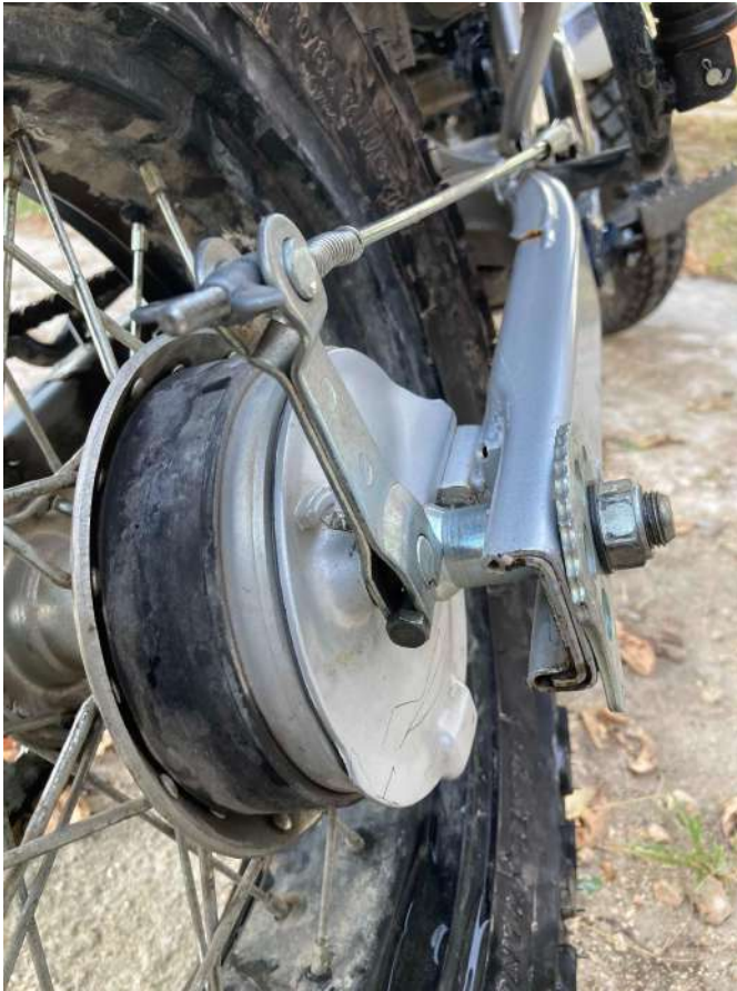
Drum back brake (front is a disk brake).