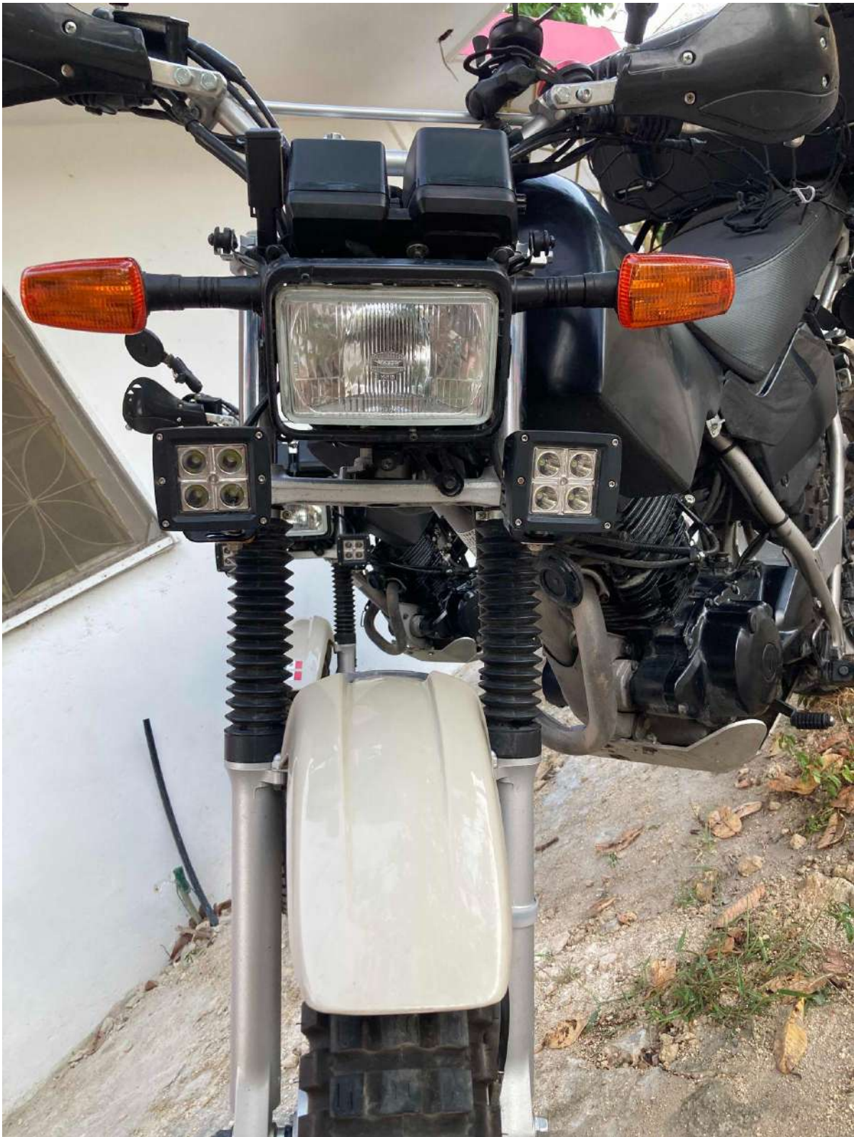
Adjustable aux lights triggered by the Hi-beam switch.