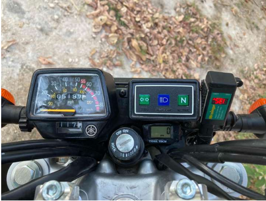
2019 TW200 - 5197 miles