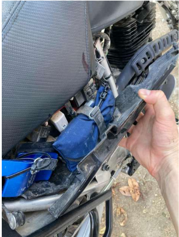
Includes a hidden cache for main tool set (Tools included). Includes small but mighty air compressor, clean title, spare keys, and machete.