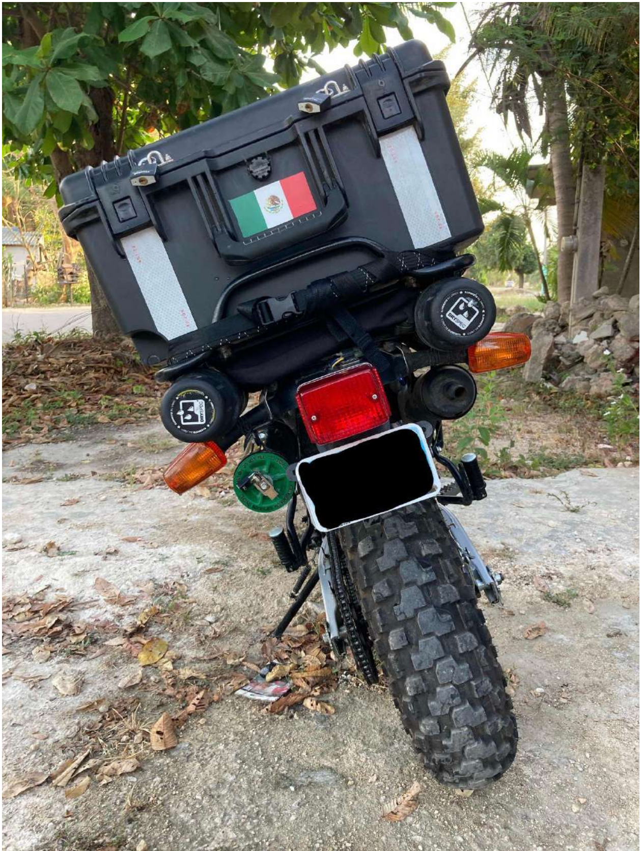
Waterproof removable/theft-proof Pelican box and 3 tool tubes.