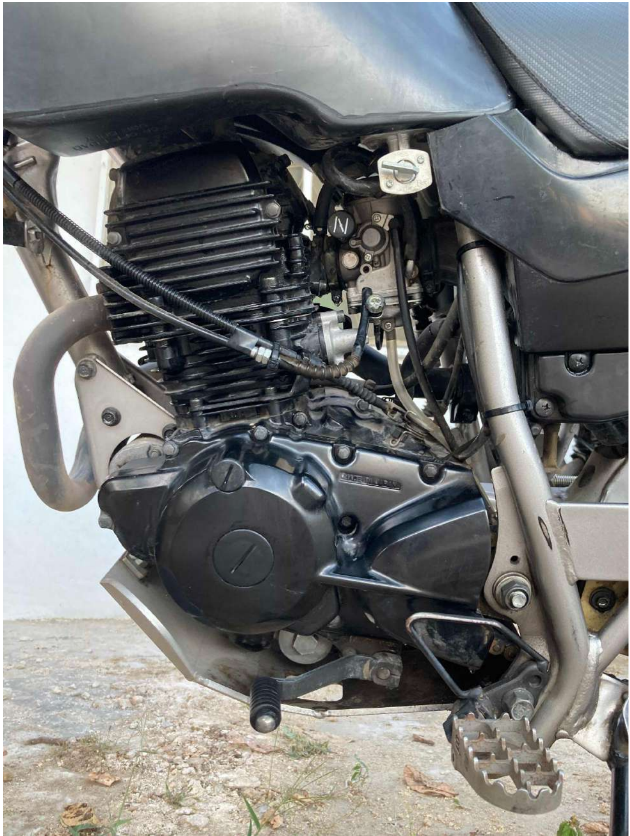
Oil changed regularly. Zero leaks. Super tough ricochet skid plate protects the engine. (The disconnected cable is a spare brake line ready to go.)