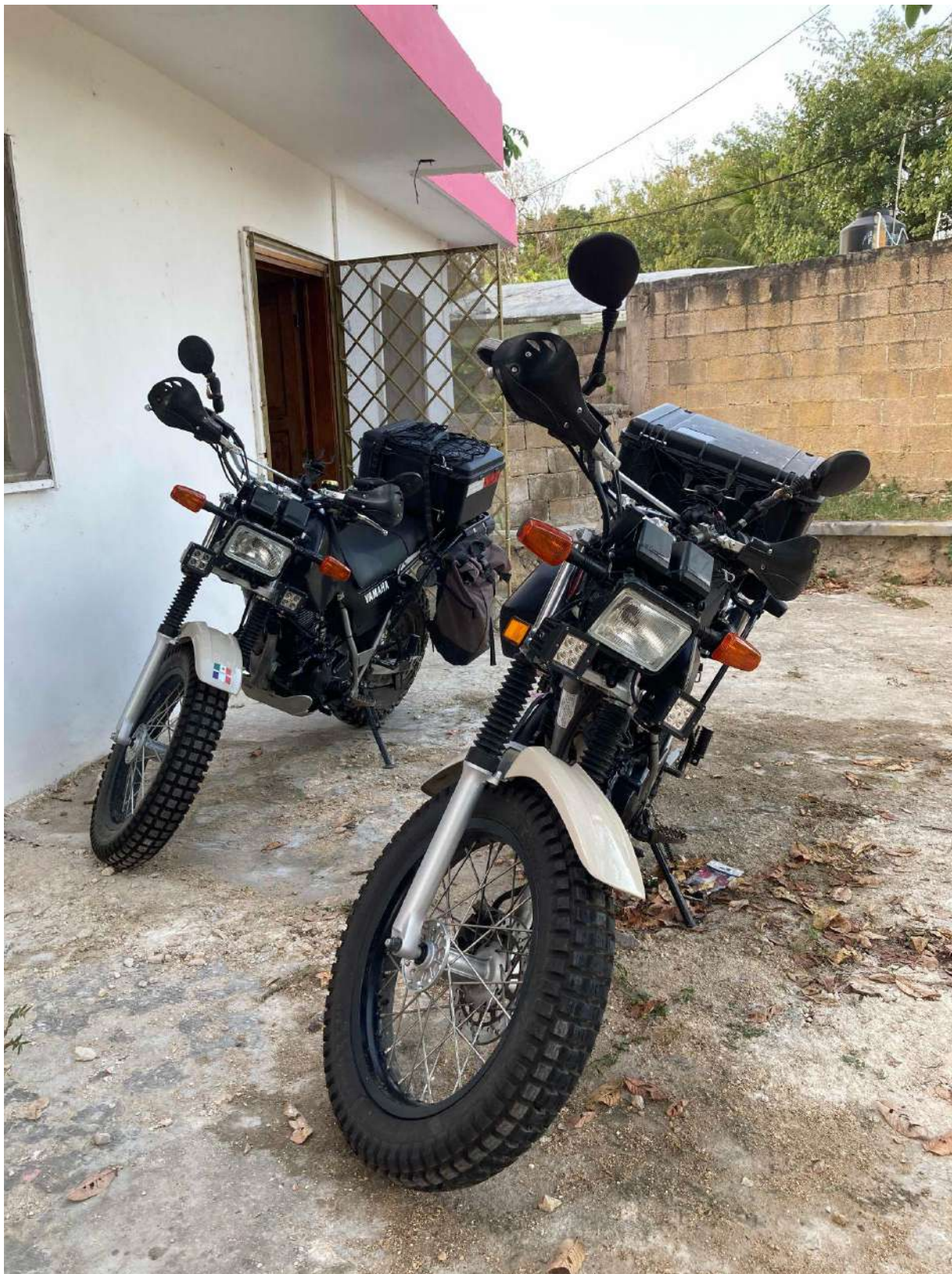
Left: 2020 TW200, Right: 2019 TW200