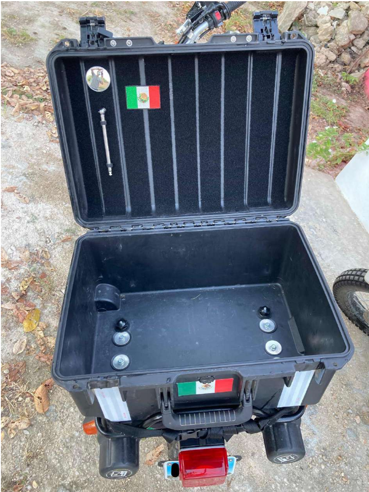
Spacious yet top box storage.