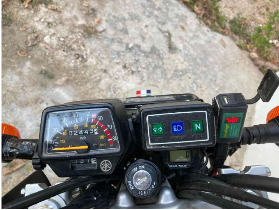
2020 TW200 - 2443 miles